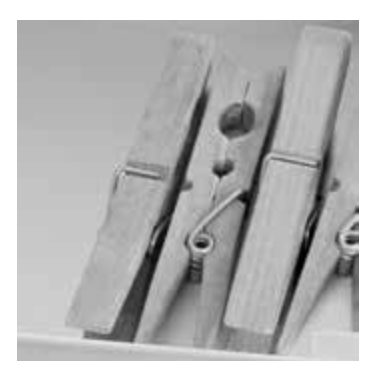
Brugsanvisning Bruksanvisning Käyttöohje Manual de utilização Instrucciones para el uso

Gebrauchsanweisung Instructions for use Mode d'emploi Gebruiksaanwijzing Istruzioni per l'uso