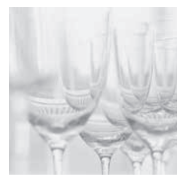
Οδηγίες χρήσης Instrukcje użytkowania Használati utasítás Инструкция за употреба