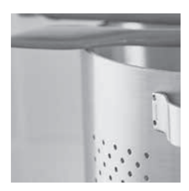
Návod k použití Návod na použitie Instrucțiuni de utilizare Инструкции по эксплуатации